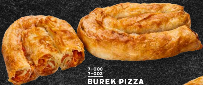
7-008 7-003 BUREK PIZZA 190 G & 260 G