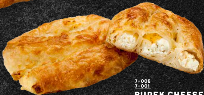
7-006 7-001 BUREK CHEESE 190 G & 260 G