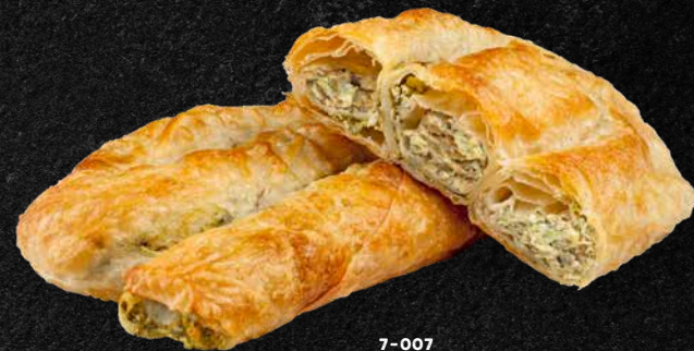
7-007 7-002 BUREK CHEESE & SPINACH 190 G & 260 G