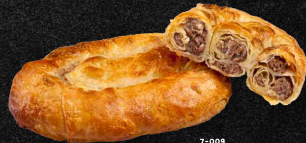
7-009 7-004 BUREK BEEF 190 G & 260 G