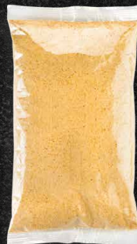
500 G 160 MM X 290 MM