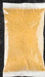
200 G 132 MM X 235 MM