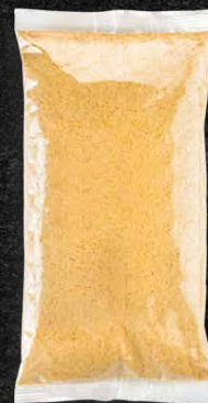
500 G 160 MM X 320 MM