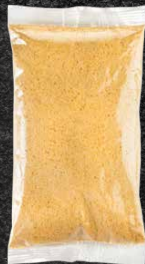
400 G 125 MM X 230 MM