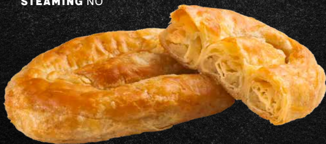
7-010 7-005 BUREK POTATO 190 G & 260 G