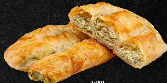
7-007 7-002 BUREK CHEESE & SPINACH 190 G & 260 G