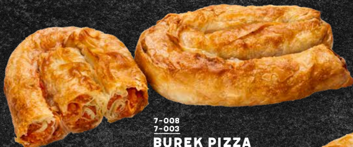
7-008 7-003 BUREK PIZZA 190 G & 260 G