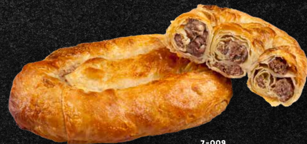
7-009 7-004 BUREK BEEF 190 G & 260 G