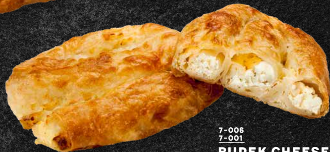
7-006 7-001 BUREK CHEESE 190 G & 260 G