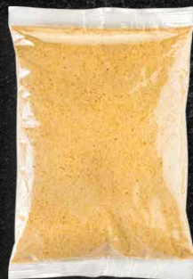
500 G 170 MM X 250 MM