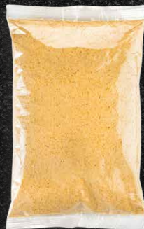
500 G 170 MM X 275 MM