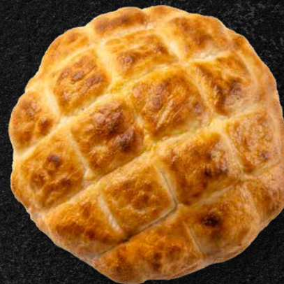
1-006 FLATBREAD 100 G Ø 11-13 CM