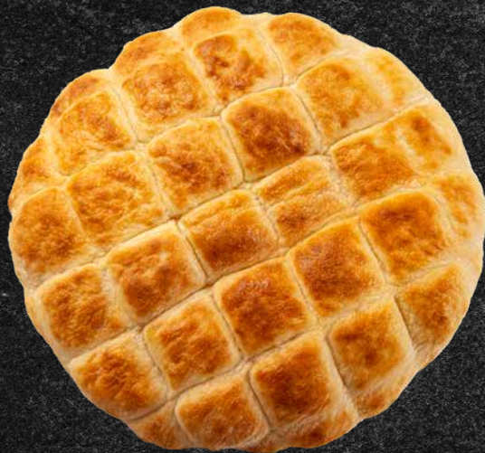
1-001 FLATBREAD 200 G Ø 18-20 CM