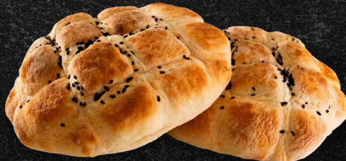
1-005 1-002 FLATBREAD WITH SESAME AND CUMIN SEEDS 150 G Ø 14-16 CM 200 G Ø 18-20 CM